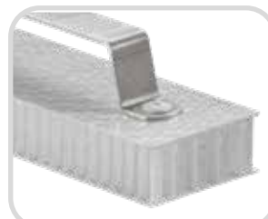
PP honeycomb + PP GF top layer Pull-out force 800 N