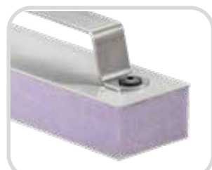
XPS-foam + PS GF top layer Pull-out force 500 N