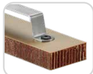
Aramid honeycomb + Aramid fibre top layer Pull-out force 700-1,200 N