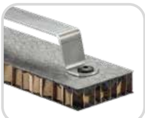
Paper honeycomb + PUR GF top layer Pull-out force 900 N