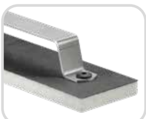
Rohacell foam + CRP top layer Pull-out force 1,300-1,700 N