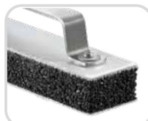
EPP foam + PP GF top layer Pull-out force 500-900 N