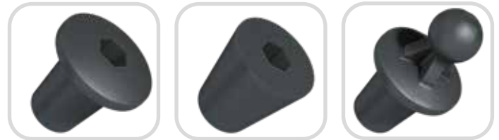
EJOT TSSD® Ø 9 x 12

The EJOT TSSD® (thermal adhesive bonding boss / German: Thermischer Stoff-Schluss-Dom) has been developed including the appropriate joining process, in order to realise fastening options for lightweight material. The process is suitable for sandwich elements with hollow core and foam core structures with different top layers preferably with fibre content. The TSSD® can be used as a screw boss for the DELTA PT® screw, or directly as fastening element.