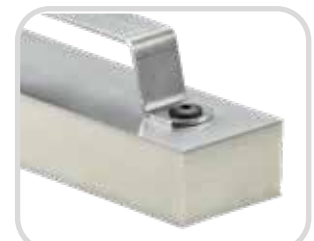
PUR foam + 0.6mm Aluminium AW3003 Pull-out force 800 N