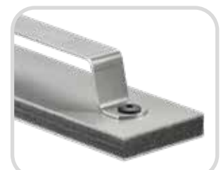
PP GF Foam + PP GF top layer Pull-out force 1,900 N

For more information please contact Niko Müller, phone +49 2751 529-5959, e-mail nmueller@ejot.com